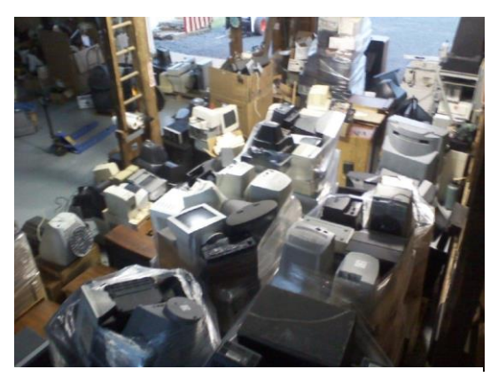
Electronics were previously stored within the collection