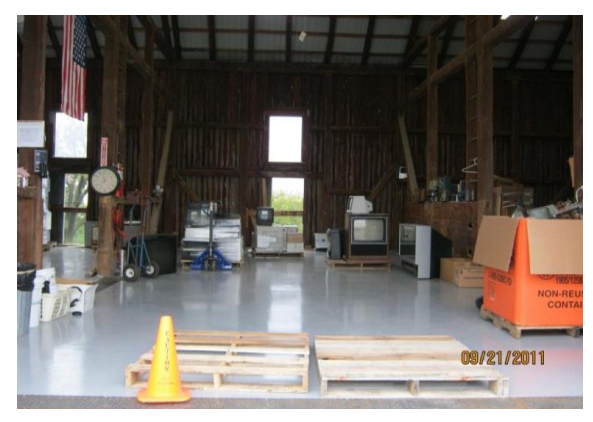
The electronic collection area, after the construction of our new storage building.