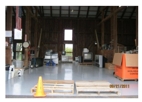
The electronic collection area, after the construction of our new storage building.